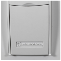
6ST3058 ST01 White Replacement Door