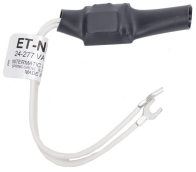
ET-NF RC Snubber Noise Filter 24-277 VAC for Electronic Controls