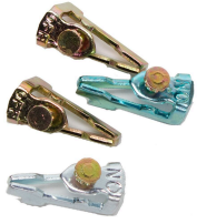
156T1978A Extra/replacement trippers 1 ON and 2 OFF