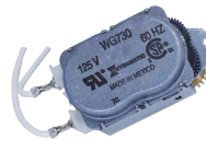
WG730-14D 125 VAC, 60 Hz Motor for R8800, T1900, T1970, and T8800 Series