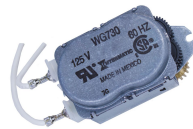
WG730-14DMX 125 VAC, 60 Hz Motor for R8800, T1900, T1970, and T8800 Series