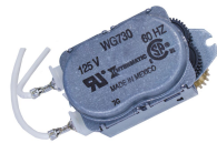
WG730-14D 125 VAC, 60 Hz Motor for R8800, T1900, T1970, and T8800 Series