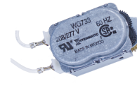
WG733-14D 208-277 VAC, 60 Hz Motor for R8800, T1900, T1970, and T8800 Series