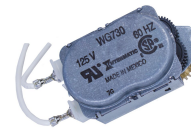
WG730-14DMX 125 VAC, 60 Hz Motor for R8800, T1900, T1970, and T8800 Series