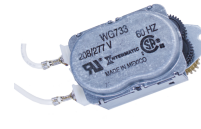
WG733-14DMX 208-277 VAC, 60 Hz Motor for R8800, T1900, T1970, and T8800 Series