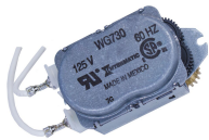
WG730-14D 125 VAC, 60 Hz Motor for R8800, T1900, T1970, and T8800 Series