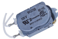
WG730-14DMX 125 VAC, 60 Hz Motor for R8800, T1900, T1970, and T8800 Series