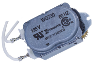
WG730-14D 125 VAC, 60 Hz Motor for R8800, T1900, T1970, and T8800 Series