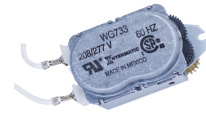
WG733-14DMX 208-277 VAC, 60 Hz Motor for R8800, T1900, T1970, and T8800 Series