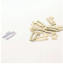
156T1950A Set of 12 Trippers for T1900, T2000, C8800, R8800 and T8800 Series