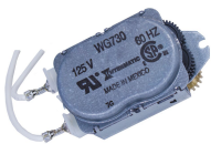
WG730-14DMX 125 VAC, 60 Hz Motor for R8800, T1900, T1970, and T8800 Series