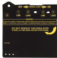
124T1952 Insulator for Double-Pole Time Switch (T103, T104, T105, T173, T174, T175, T176, T185, WH40)