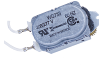
WG733-14D 208-277 VAC, 60 Hz Motor for R8800, T1900, T1970, and T8800 Series