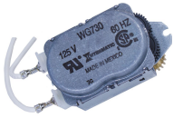
WG730-14D 125 VAC, 60 Hz Motor for R8800, T1900, T1970, and T8800 Series