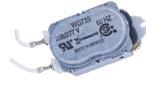
WG733-14DMX 208-277 VAC, 60 Hz Motor for R8800, T1900, T1970, and T8800 Series