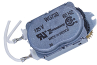
WG730-14DMX 125 VAC, 60 Hz Motor for R8800, T1900, T1970, and T8800 Series