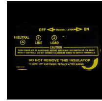
124T1948 Insulator for Single-Pole Time Switch (T101, T102, T171, T172)