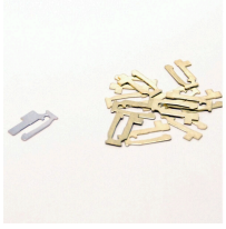
156T1950A Set of 12 Trippers for T1900, T2000, C8800, R8800 and T8800 Series