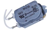
WG730-14D 125 VAC, 60 Hz Motor for R8800, T1900, T1970, and T8800 Series