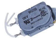
WG730-14DMX 125 VAC, 60 Hz Motor for R8800, T1900, T1970, and T8800 Series