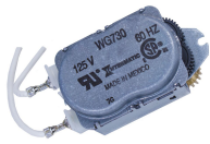
WG730-14D 125 VAC, 60 Hz Motor for R8800, T1900, T1970, and T8800 Series