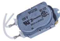
WG730-14DMX 125 VAC, 60 Hz Motor for R8800, T1900, T1970, and T8800 Series