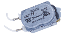
WG733-14DMX 208-277 VAC, 60 Hz Motor for R8800, T1900, T1970, and T8800 Series