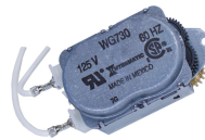
WG730-14D 125 VAC, 60 Hz Motor for R8800, T1900, T1970, and T8800 Series