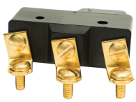
133T701A Replacement Snap Switch for T1900 and T2000 Series