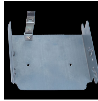
22T338GR Mounting Bracket for Intermatic Standardized Timer Mechanisms