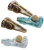
156T1978A Extra/replacement trippers 1 ON and 2 OFF