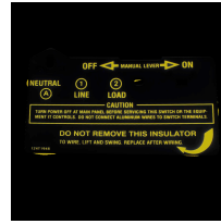
124T1948 Insulator for Single-Pole Time Switch (T101, T102, T171, T172)