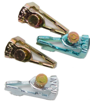
156T1978AMX 1 Set of ON/OFF Trippers for T100, T7000, and WH40