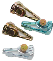
156T1978AMX 1 Set of ON/OFF Trippers for T100, T7000, and WH40