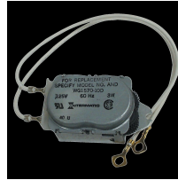
WG1570-10DMX 125 VAC, 60 Hz Motor for T101, T103, T105