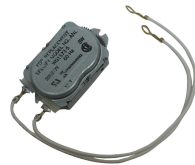
WG1573-10DMX 208-277 VAC, 60 Hz Motor for T102, T104, T106, T172, T174, T176, WH40