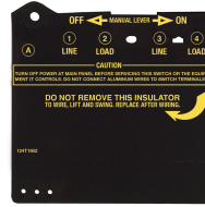
124T1952 Insulator for Double-Pole Time Switch (T103, T104, T105, T173, T174, T175, T176, T185, WH40)