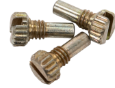
156T3085A Skipper Screws for T170 Series, T1400 Series, and T1800 Series