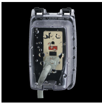
WP1000C Plastic In-Use Weatherproof Cover, Single-Gang, Vrt, 2.25" Clear