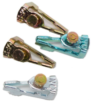
156T1978A Extra/replacement trippers 1 ON and 2 OFF