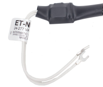
ET-NF RC Snubber Noise Filter 24-277 VAC for Electronic Controls