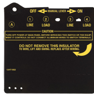
124T1952 Insulator for Double-Pole Time Switch (T103, T104, T105, T173, T174, T175, T176, T185, WH40)