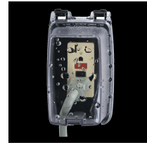
WP1000C Plastic In-Use Weatherproof Cover, Single-Gang, Vrt, 2.25" Clear