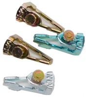
156T1978A Extra/replacement trippers 1 ON and 2 OFF