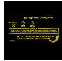
124T1948 Insulator for Single-Pole Time Switch (T101, T102, T171, T172)