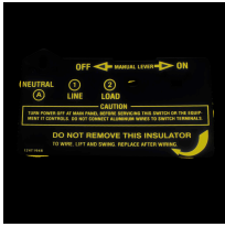
124T1948 Insulator for Single-Pole Time Switch (T101, T102, T171, T172)