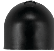
6LV1352 Light Shield Accessory for EK4036S, EK4436SM, K4000 Series Button Photocontrols