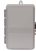
E200 Case-Outdoor, Type 3R Plastic, Gray