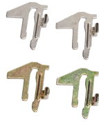
156EB1945A Trippers for E1020 (Pack of 2)