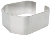
22LG0120 Light Guard Accessory for EK4000 Series Electronic Fix Mount Photocontrols