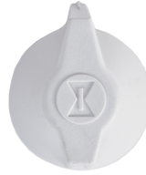
146--00046 Knob-Wall Switch FD Series - White