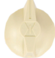
146--00047 Knob-Wall Switch FD Series - Almond