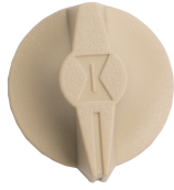
146--00045 Knob-Wall Switch FD Series - Ivory