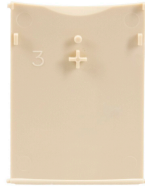
6ST3056 ST01 Ivory Replacement Door