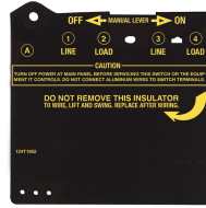
124T1952 Insulator for Double-Pole Time Switch