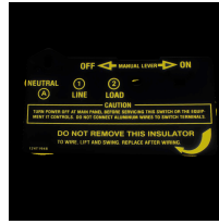
124T1948 Insulator for Single-Pole Time Switch (T101, T102, T171, T172)