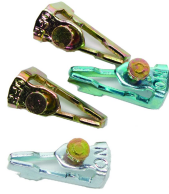
156T1978A Extra/replacement trippers 1 ON and 2 OFF