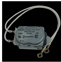
WG1570-10D 125 VAC, 60 Hz Motor for T101, T103,