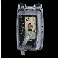
WP1000C Plastic In-Use Weatherproof Cover, Single-Gang, Vrt, 2.25" Clear