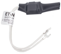
ET-NF RC Snubber Noise Filter 24-277 VAC for Electronic Controls