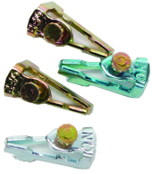
156T1978A Extra/replacement trippers 1 ON and 2 OFF