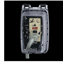
WP1000C Plastic In-Use Weatherproof Cover, Single-Gang, Vrt, 2.25" Clear