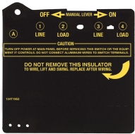
124T1952 Insulator for Double-Pole Time Switch (T103, T104, T105, T173, T174, T175, T176, T185, WH40)