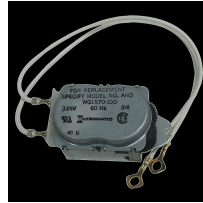
WG1570-10DMX 125 VAC, 60 Hz Motor for T101, T103, T105