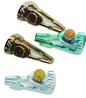
156T1978A Extra/replacement trippers 1 ON and 2 OFF