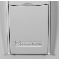
6ST3058 ST01 White Replacement Door