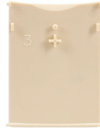
6ST3056 ST01 Ivory Replacement Door