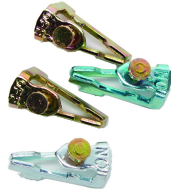
156T1978A Extra/replacement trippers 1 ON and 2 Skipper Screws (3 per package) OFF