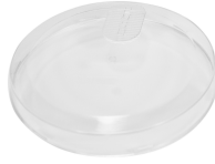
017600546 Glass, Clear, TSM1 Series