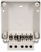
017800022 Base, 1-Channel, TCC Series