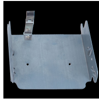
22T338GR Mounting Bracket for Intermatic Standardized Timer Mechanisms